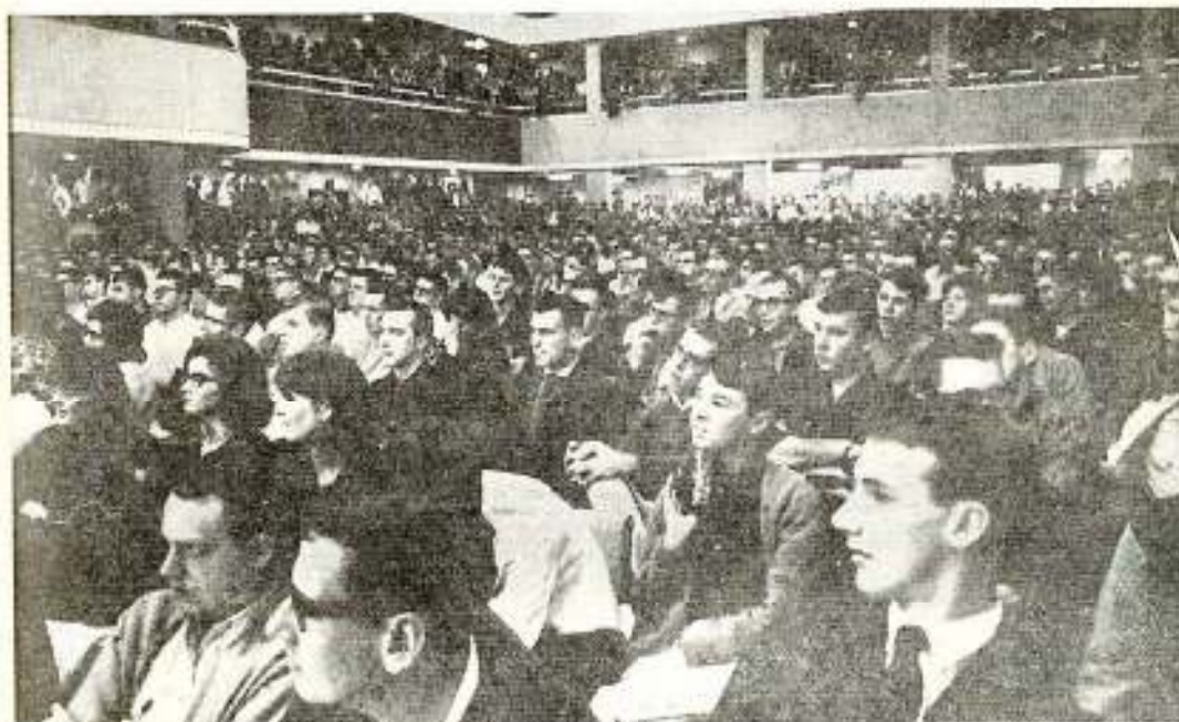
Students crammed every corner of the ballroom, hung over the balconies and stood on chairs around the sides. Folding doors were opened into adjoining rooms and the public address system carried the controversial Nazi's words into the rest of the building clogged with even more students who couldn't squeeze in.

squeeze into the ballroom and many stood on chairs and tables. The rest listened on the building's public address system from hallways, lobbies and other meeting rooms.